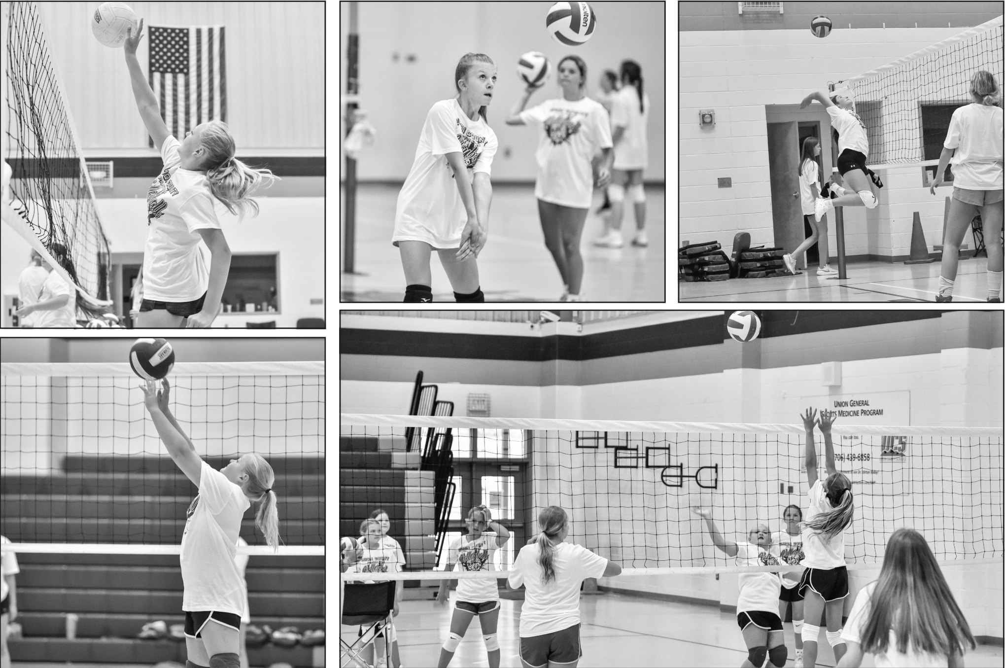
Union County volleyball campers in action at the UCMS gymnasium on Thursday, July 13.