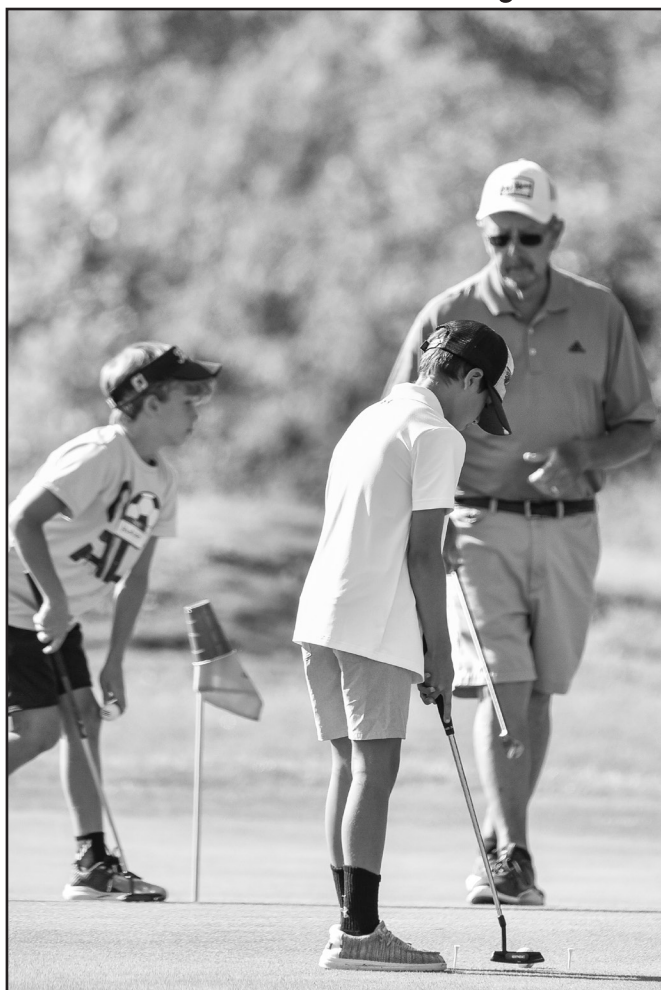
Junior golfers practice on the putting green.

For more information, tee times or upcoming tournaments, visit www.olduniongolf.com.